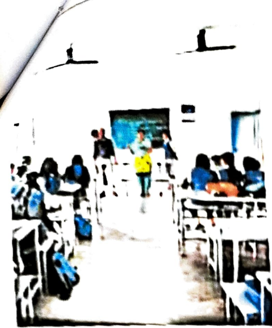
Spreading awareness among the students