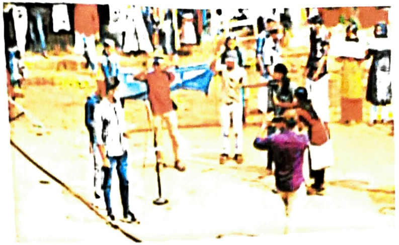
Street Drama for Awareness in association with SVEEP Palakkad