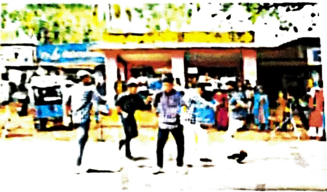
Flash Mob at Kadambarhippuram