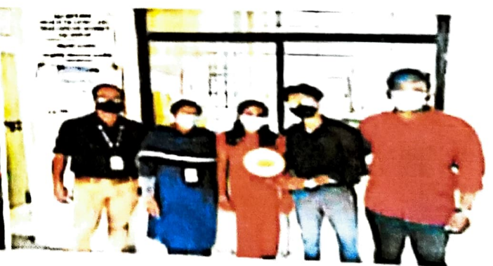
Receiving appreciation award from District Collector for the valuable contribution by NSS Volunteers towards SVEEP Initiatives