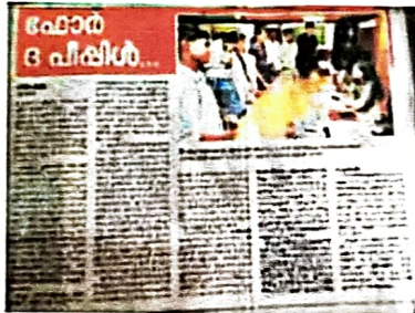
Debate on Democratic Values with District Collector